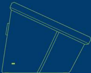
Kensington Lock Security Slot for theft protection

Built-in MSR, MSR+RFID+NFC, MSR+ibutton as option